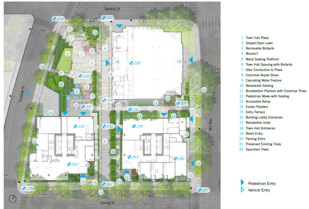
Figure 1: Landscape plan